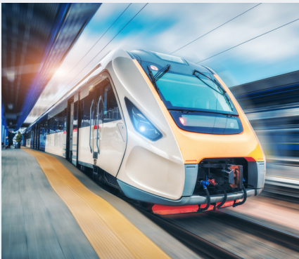
Rolling Stock MRO