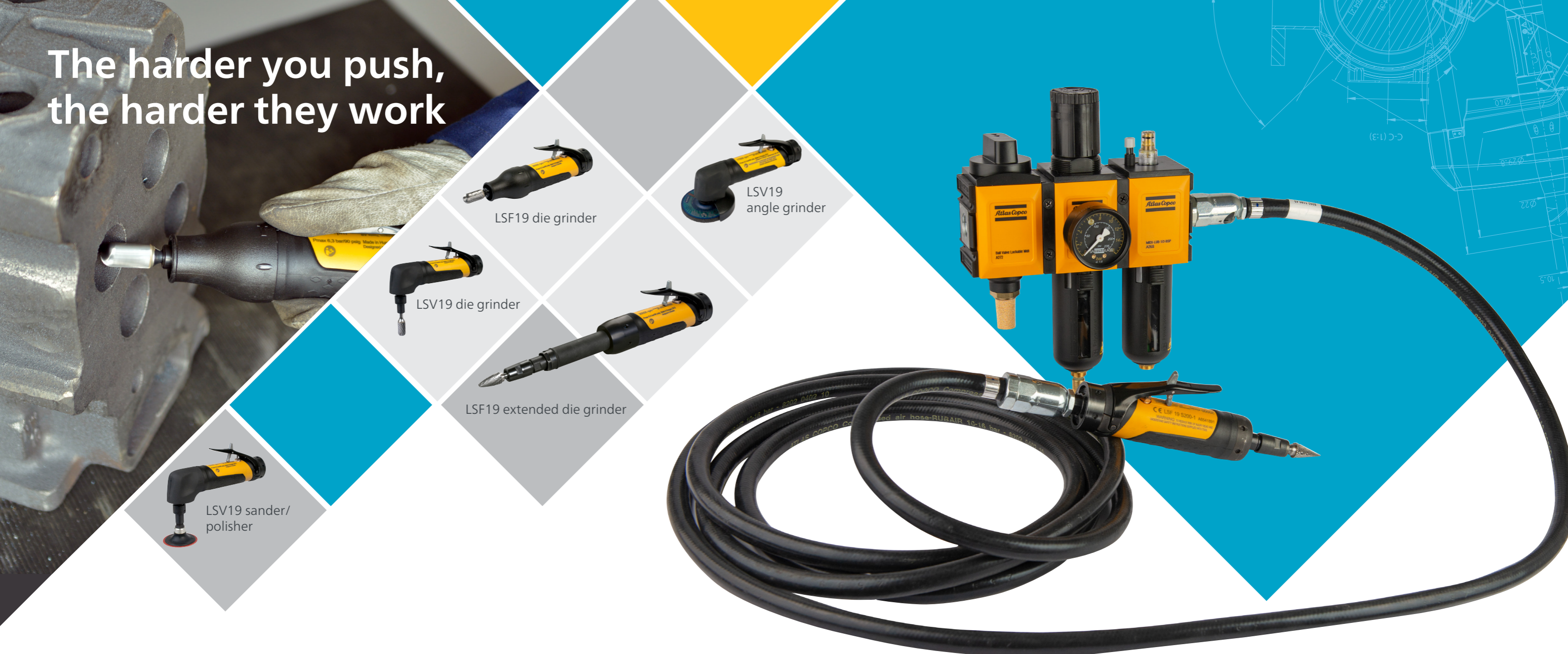
LSF19 die grinder

The harder you push, the harder they work