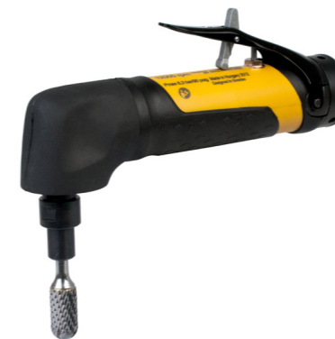
The trigger can easily be repositioned to suit the individual operator.

The LSV19-series comes in 5 different models to make it easy for you to choose the right tool for your job. There are three angled models for grinding and sanding and two straight models for die grinding, one standard and one extended. Of course all models feature the same fine tuned vane motor, something you can trust will just keep on going. The same applies to the angle gears in the LSV models, they are built to last.