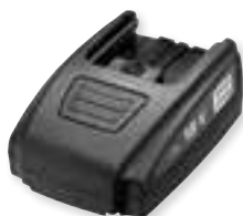
Low weight with flat pack battery.