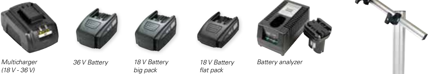
Multicharger (18 V - 36 V)