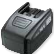
Work for twice as long with the big pack battery.