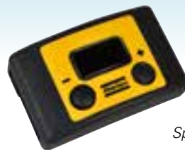
Speed setting unit

The tool shuts off automatically at the preset torque. If the tightening is OK, the LED on the upper part of the tool shows a green light that is visible from a wide angle. If the tightening result is not OK, a red light will alert you. The LED also tells you the status of the battery and gives a low battery warning. A buzzer can be activated to make the feedback even more clear. These features verify your tightening results and give you peace of mind.