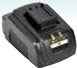
Multicharger (Fits all Atlas Copco batteries)