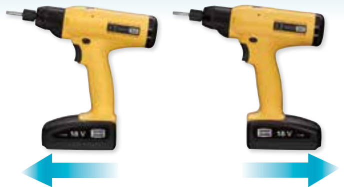
Optimum accessibility with variable battery position.