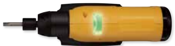
Direct feedback with big LED.