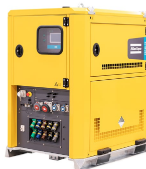
ZBP45-75 for reference