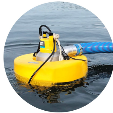
Pump raft 25 - 55 Pump rafts 25 and 55 consist of a float ring, a strainer and a tightening strap.