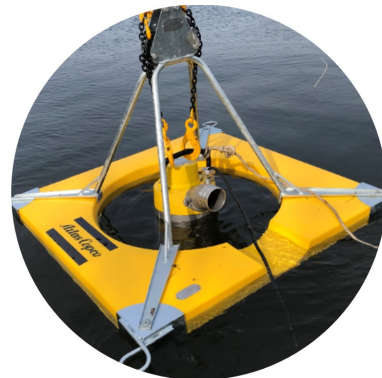
Pump raft 80 - 170 - 260 - 400 - 550 The pump rafts 80 up to 550 consist of a modular system where preselected models meet the required lifting capacity for pump models D60 up to D100. For other WEDA sludge or slurry pumps, check the weight of the pump and choose a suitable pump raft system.