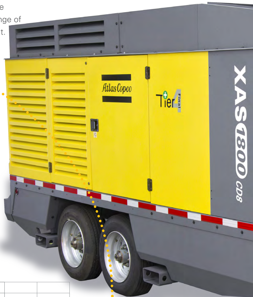
Variable Flow and Pressure (Operating range)

The all new XAS 1800 CD8 has extended its operating range, over the iT4 model, allowing up to 200 psi making it the most versatile machine its class. The variable flow and pressure allows for operation in a wider range of applications. Specifically for rental customers this increases the applications where the machine can be used increasing fleet utilization and ROI.